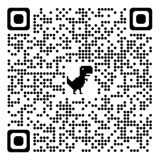
QR code for USDF Regional Adult Amateur Equitation Program