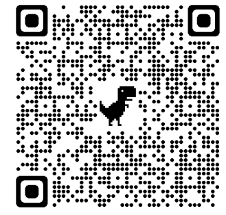
QR code for USDF Dressage Seat Medal Program